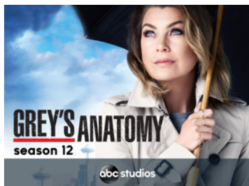
After 348 tries, Grey's