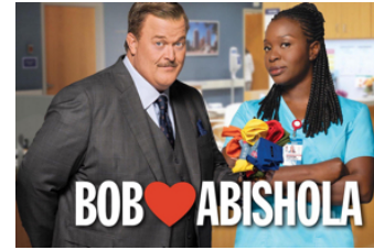
Bob Hearts Abishola